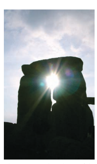
The setting sun through one of the trilithons of Stonhenge.

This enchantment of the landscape is exactly what Orpheus is reputed to have done with his music, casting a benign spell